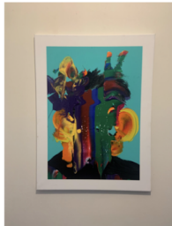
THE TOY AT THE BOTTOM