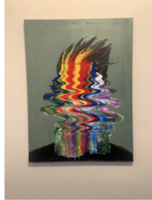
WATCHING VHS WITH MY DAD