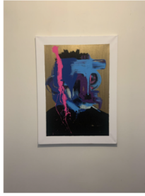
GOD IS A BACKYARDIGAN