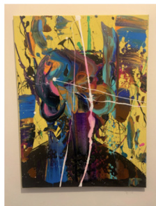
THE DRUGS DON'T WORK